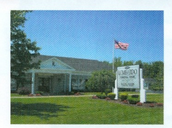
ORCHARD PARK 3060 Abbott Road Near Lake Ave. 823-4812

Direct Cremation - Funeral Home Charge $52900